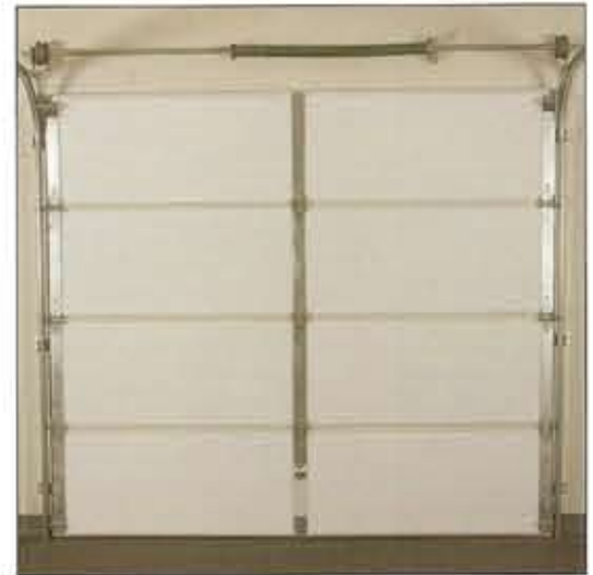
Shown with optional vinyl-backed insulation feature.