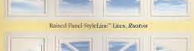
Raised Panel StyleLine™ Lites, Ruston

Snap-In Design lets you install StyleLine™ inserts yourself, change them as you please, remove them easily for door painting or glass cleaning.