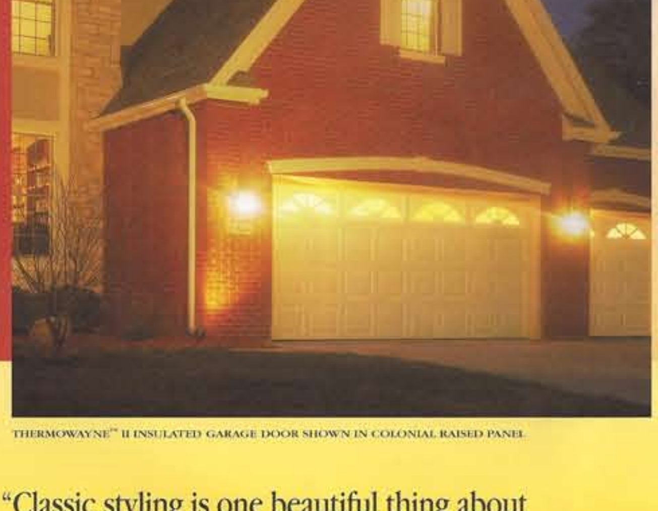
THERMOWAYNE™ II INSULATED GARAGE DOOR SHOWN IN COLONIAL RAISED PANEL.

“Classic styling is one beautiful thing about our best garage door. Safety is another.”