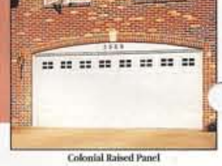
Colonial Raised Panel